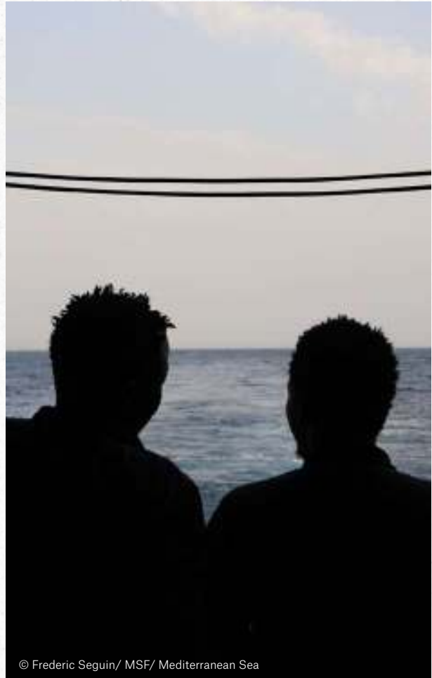
© Frederic Seguin/ MSF/ Mediterranean Sea

MSF patient, October 2023, Mediterranean Sea