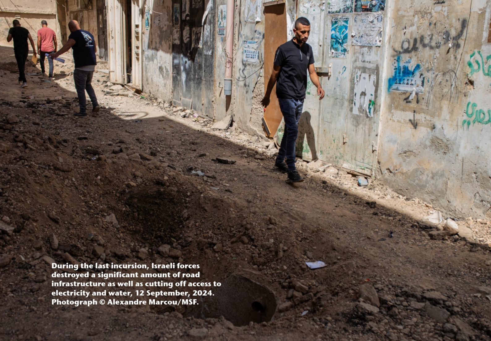
During the last incursion, Israeli forces destroyed a significant amount of road infrastructure as well as cutting off access to electricity and water, 12 September, 2024.