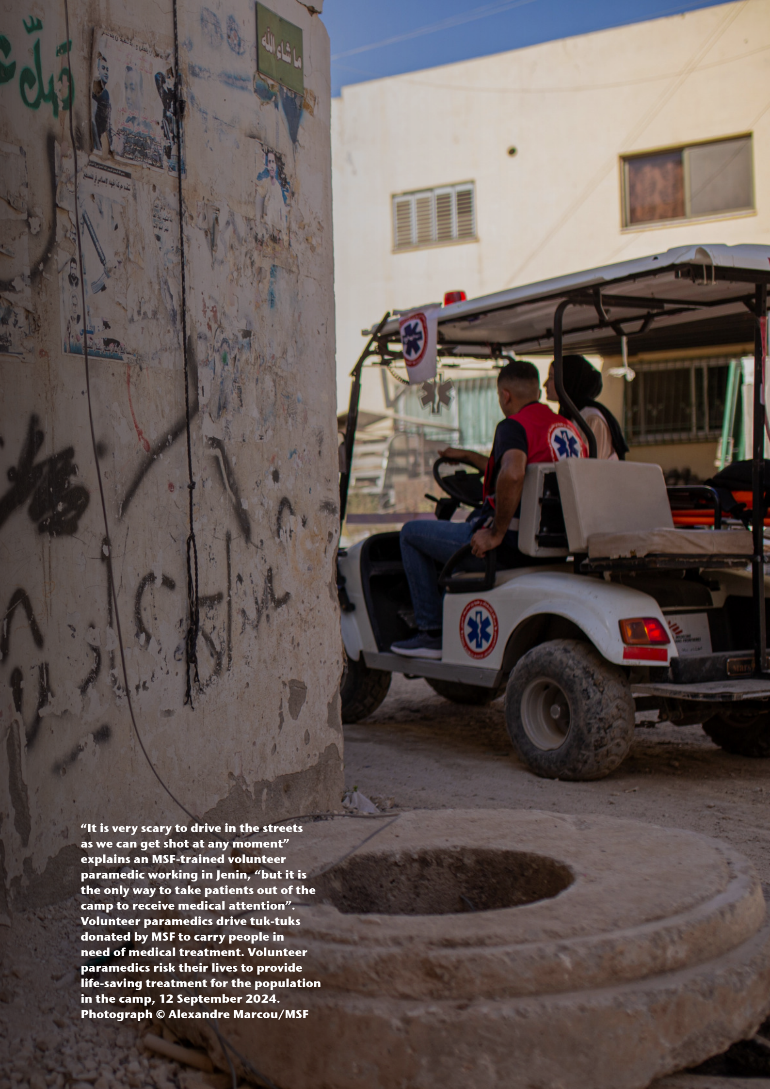
“It is very scary to drive in the streets as we can get shot at any moment” explains an MSF-trained volunteer paramedic working in Jenin, “but it is the only way to take patients out of the camp to receive medical attention”. Volunteer paramedics drive tuk-tuks donated by MSF to carry people in need of medical treatment. Volunteer paramedics risk their lives to provide life-saving treatment for the population in the camp, 12 September 2024.