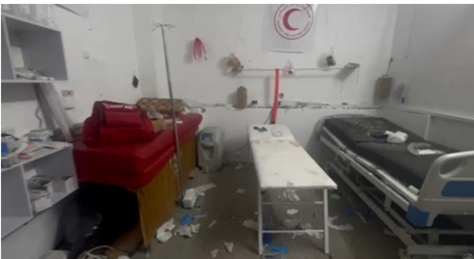
Damage done to the stabilisation point in Nur Shams camp, Tulkarem, following an Israeli incursion on 16-17 December 2023.