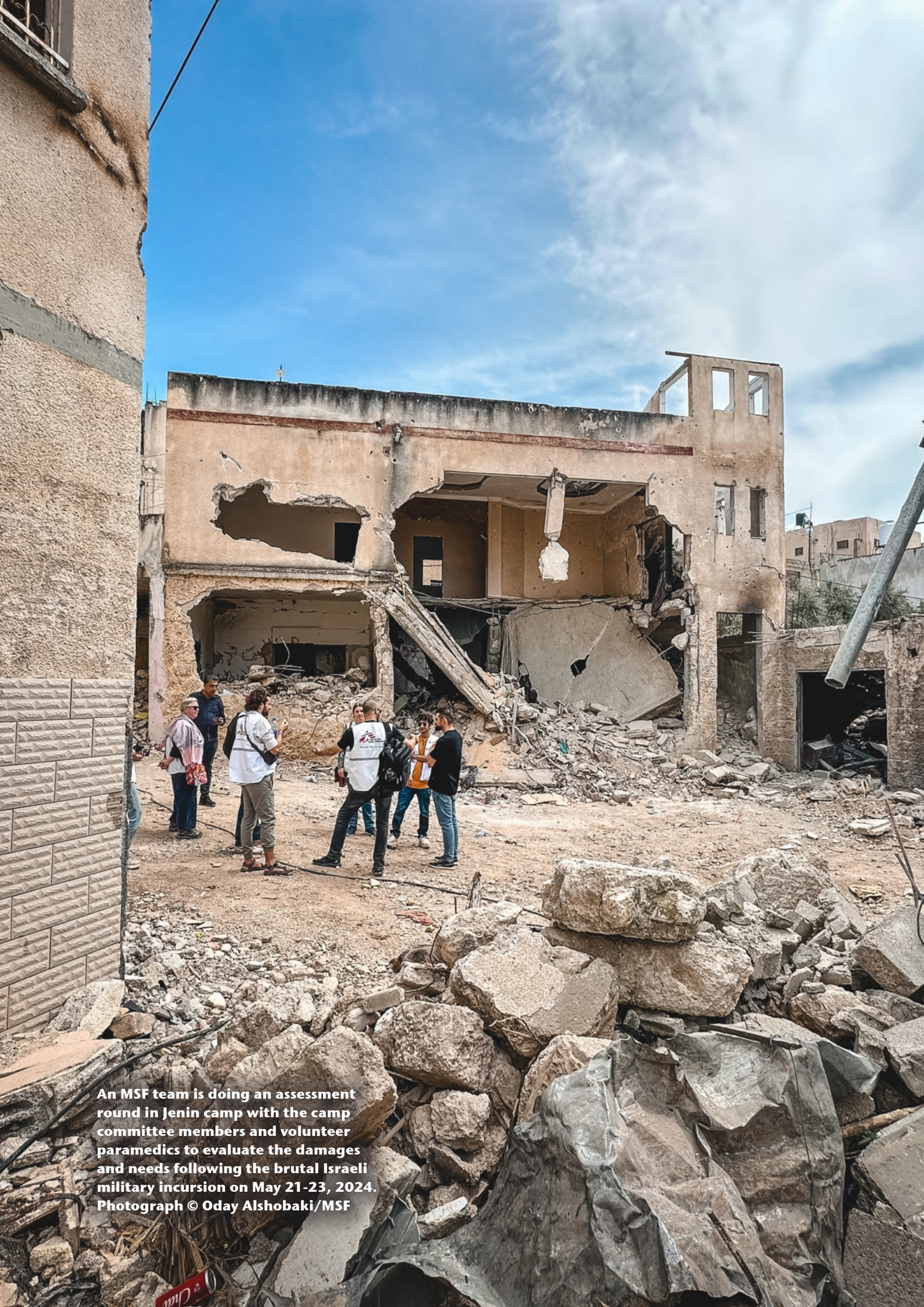
An MSF team is doing an assessment round in Jenin camp with the camp committee members and volunteer paramedics to evaluate the damages and needs following the brutal Israeli military incursion on May 21-23, 2024.